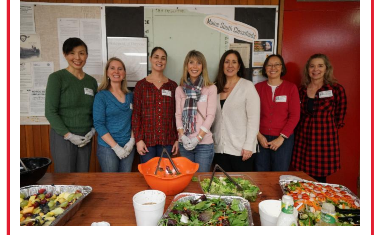
Thank you to our wonderful Maine South Parents for hosting a Holiday Lunch