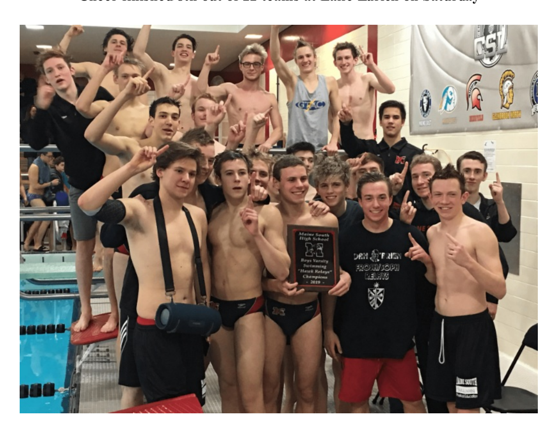
Congratulations to the Maine South Boys Swim and Dive team on winning the Hawk Relays on Saturday

This is the first time they have won the Hawk Relays in over 20 years