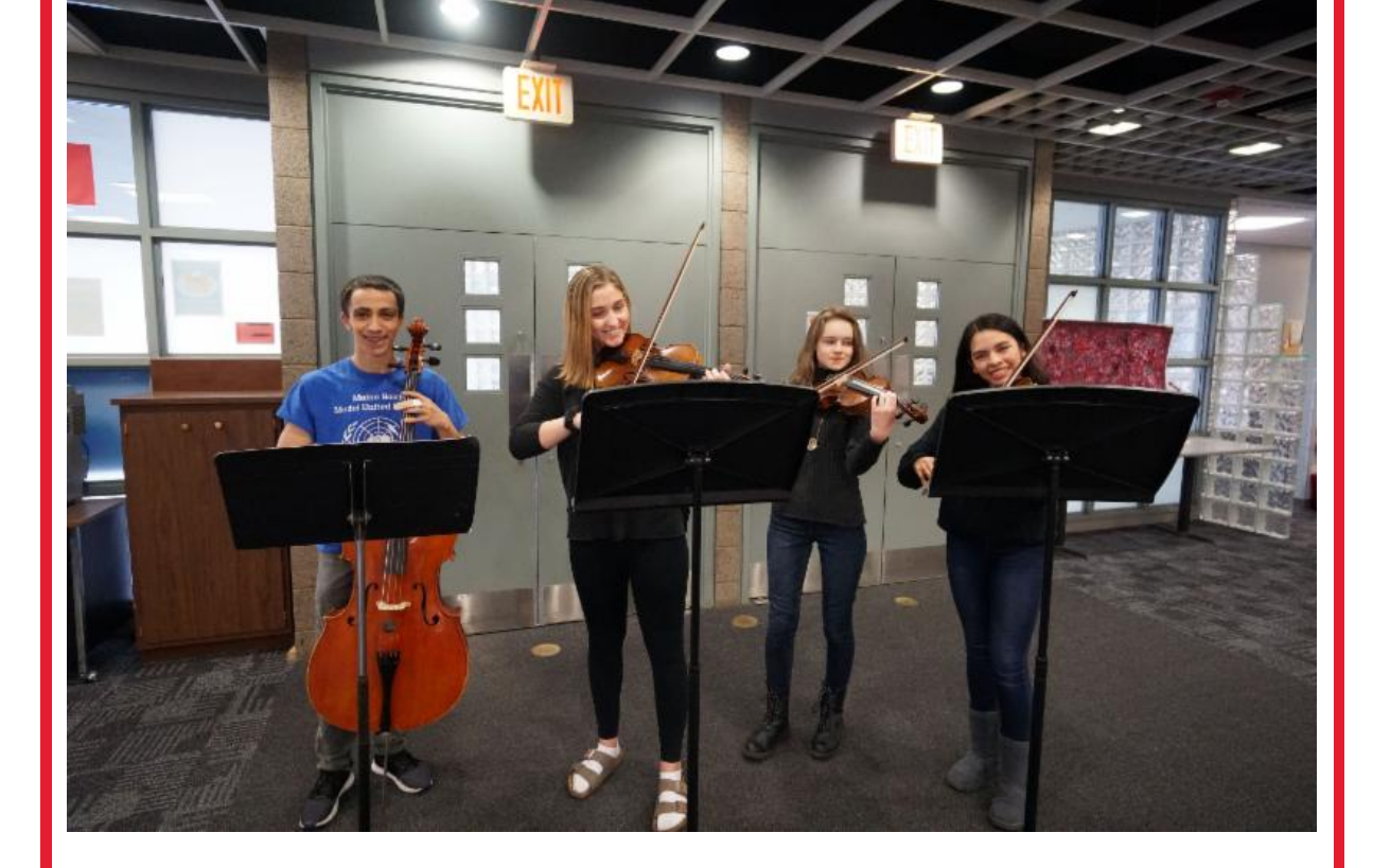
Holiday String Quartet