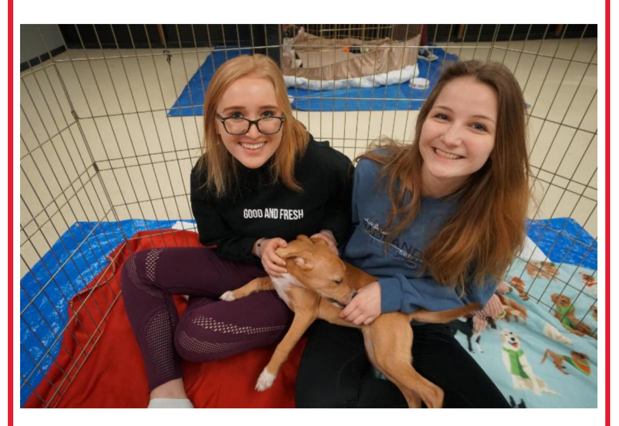
Wright-Way Rescue visited Maine South to help students relax before finals by playing with puppies

PSAT scores are available electronically for individuals to access in December, six to eight weeks after taking the exam. The College Board doesn't have the 2018 PSAT score release date finalized yet, but based on past years, it is expected that the 2018 PSAT scores to be available online around December 10, 2018. Note schools do not have access to the online scores. A hard copy of the students score report will be distributed to students in January 2019 after Winter break.