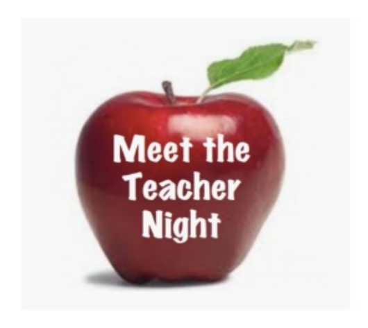
Thursday August 29, 2019