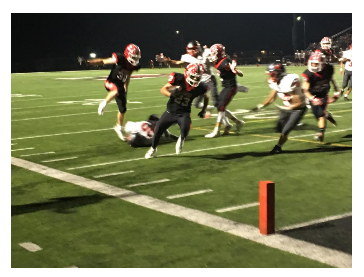
Congratulations to the Maine South Football team on their 35-27 victory over Palatine on Friday, September 20th.