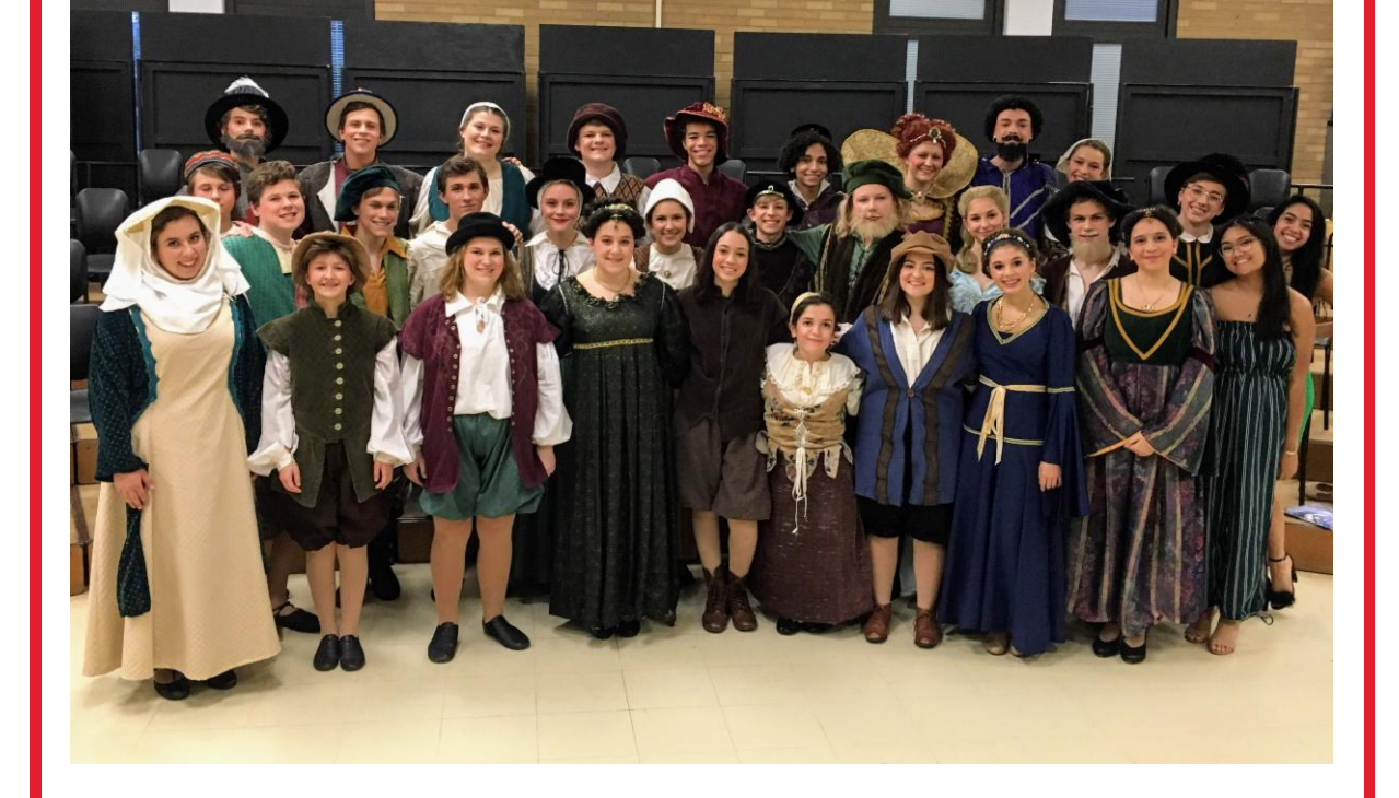
Shakespeare in Love