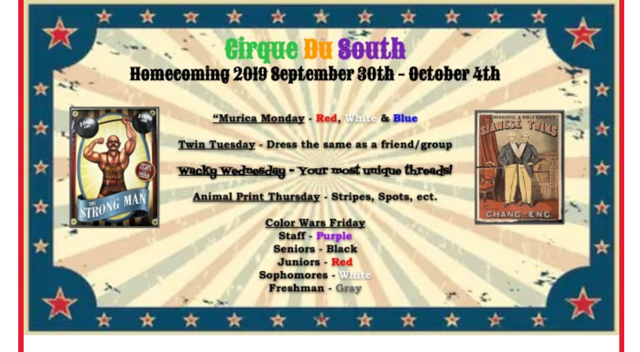
Homecoming Week Dress-Up Day Themes

Thursday, October 3rd: Wall of Honor Dinner 6:00 pm Thursday, October 3rd: Powder Puff Game 6:30 pm Friday, October 4th: Football Homecoming Game 7:00 pm Saturday, October 5th: <u>Homecoming Parade</u> 10:00 am Saturday, October 5th: Homecoming Dance 7:00 pm