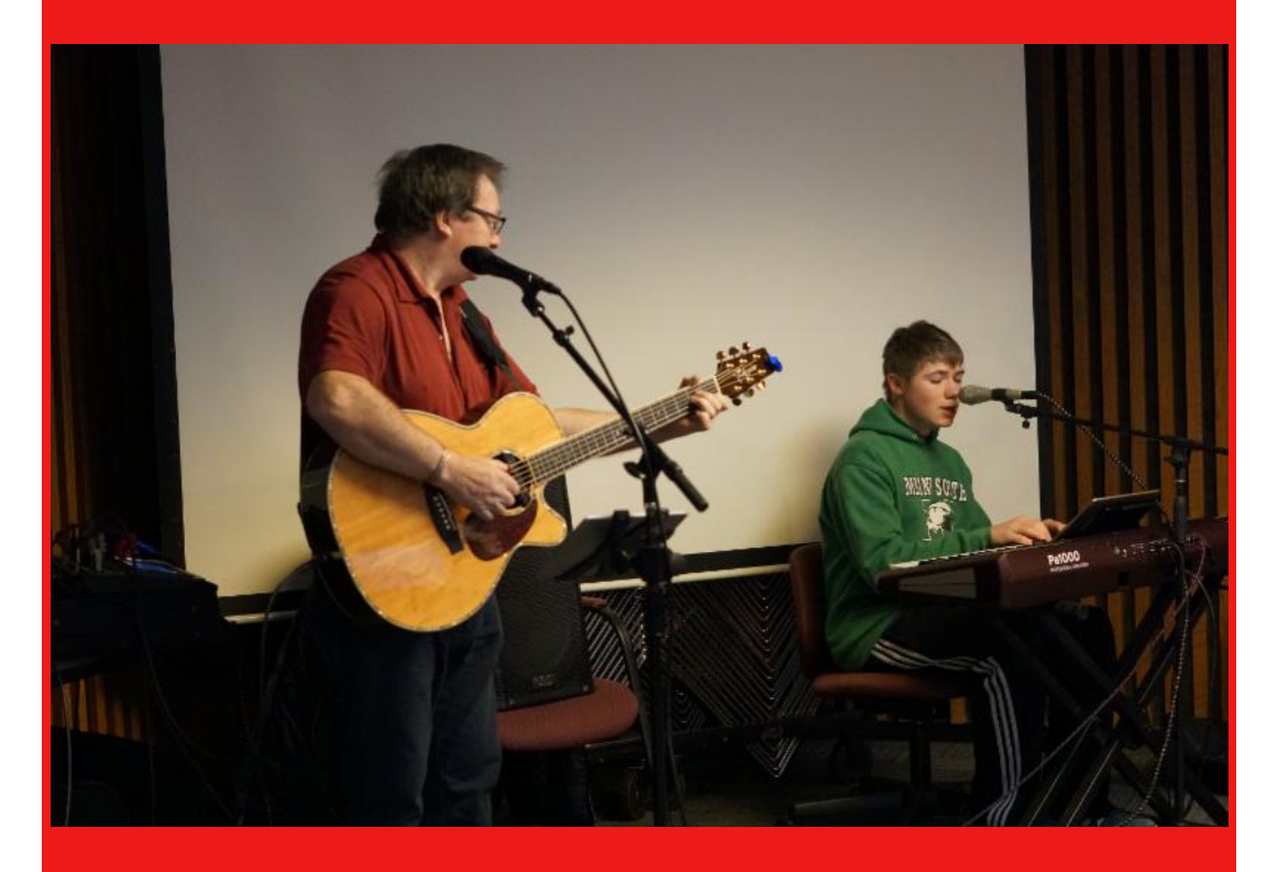
A talented father/son duo performing for the Irish Club

"A diamond is a chunk of coal that did well under pressure."