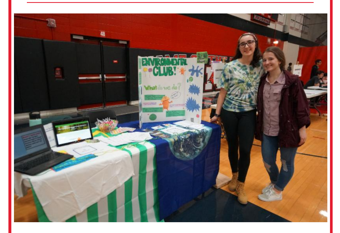
Join the Environmental Club and help save our planet!