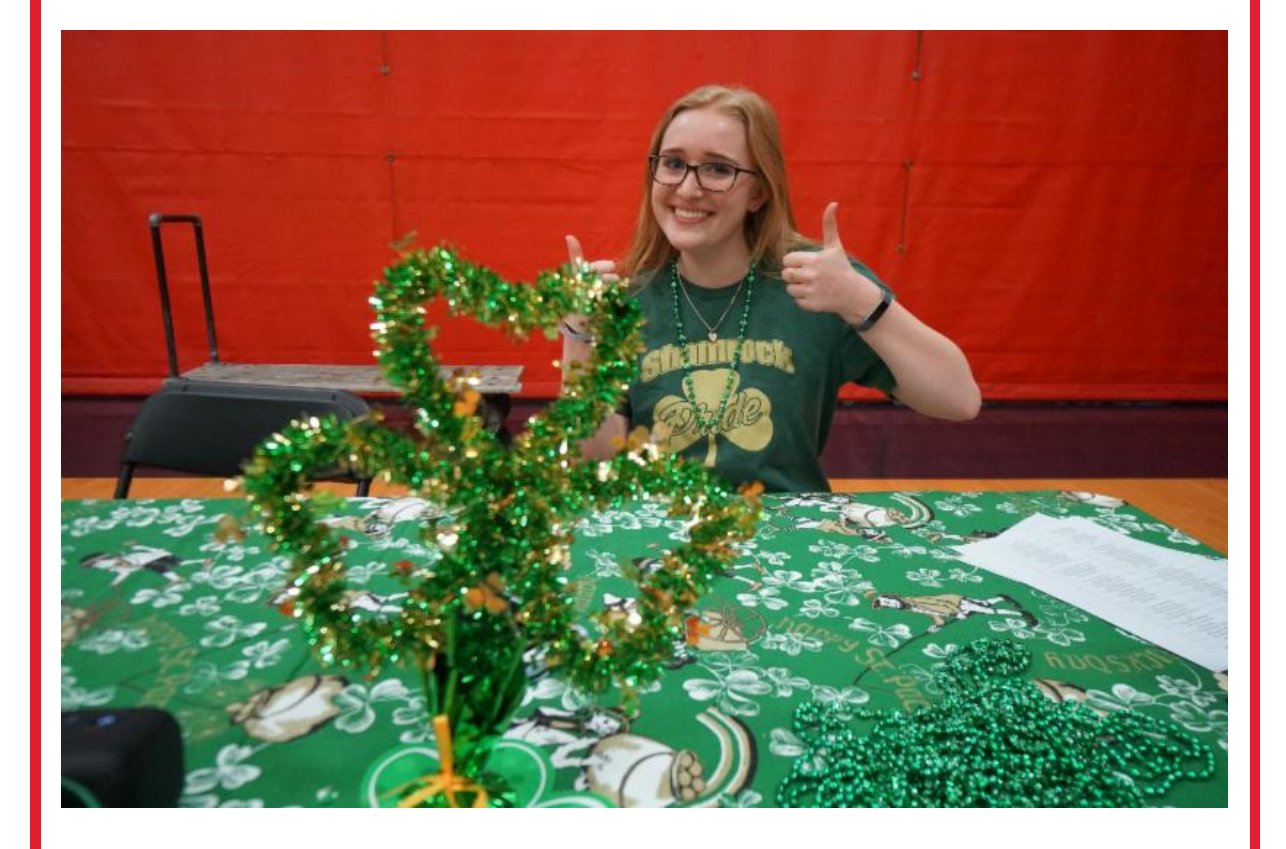
Irish Pride at the Activities Fair