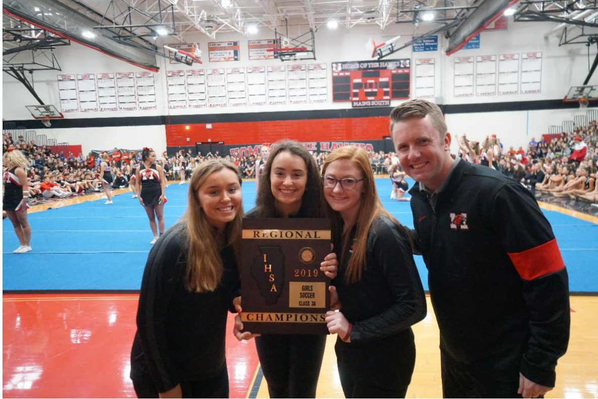
Congratulations Girls Soccer Regional IHSA Champions