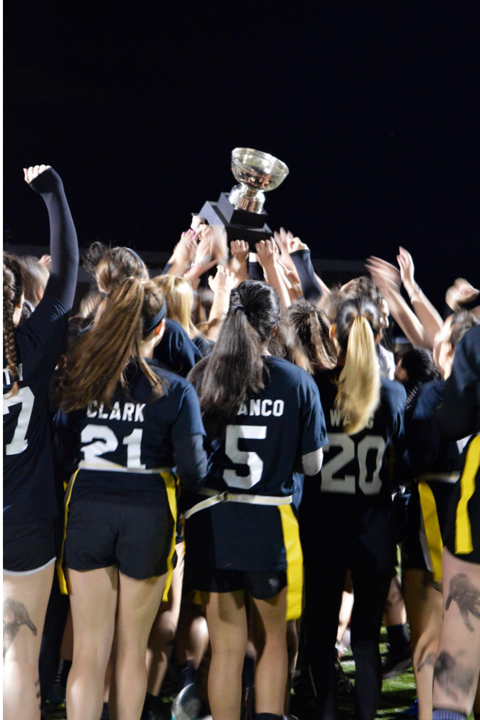
Senior Powder Puff Victory