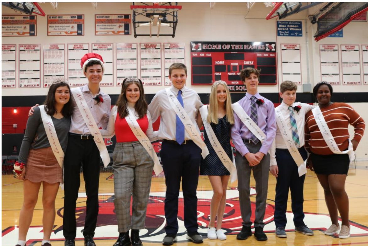
2019 Homecoming Court