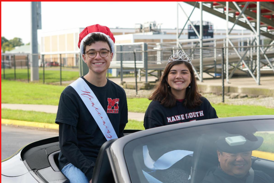
2019 Homecoming King and Queen

"Life isn't about finding yourself. Life is about creating yourself."