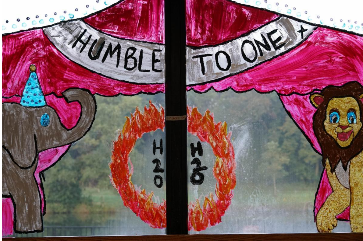
Homecoming Window Decoration Winner: Humble to One (H 2 O)