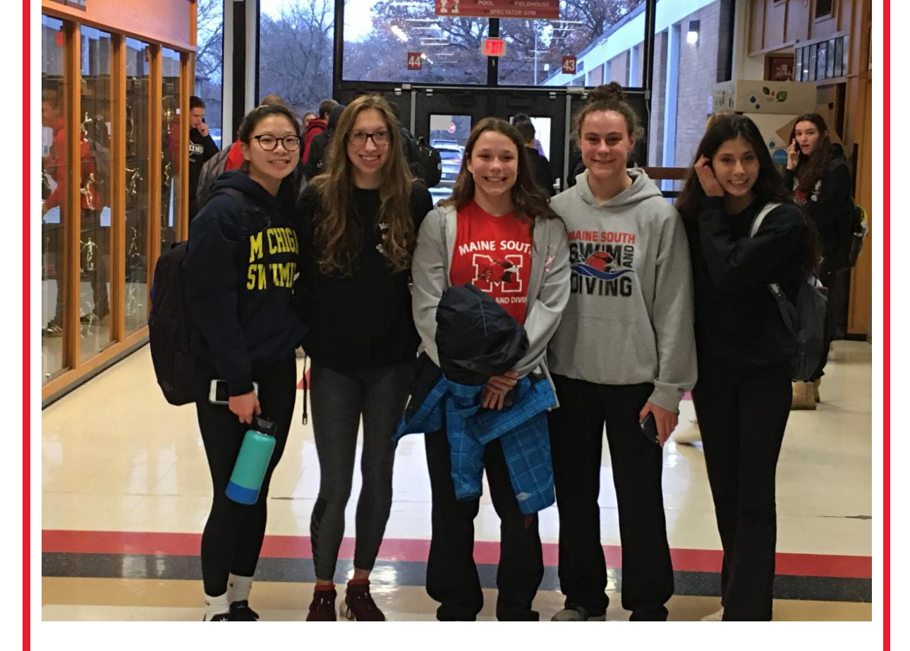
Congratulations to the Girls Swimming team on their 6th place finish at the Deerfield Sectional