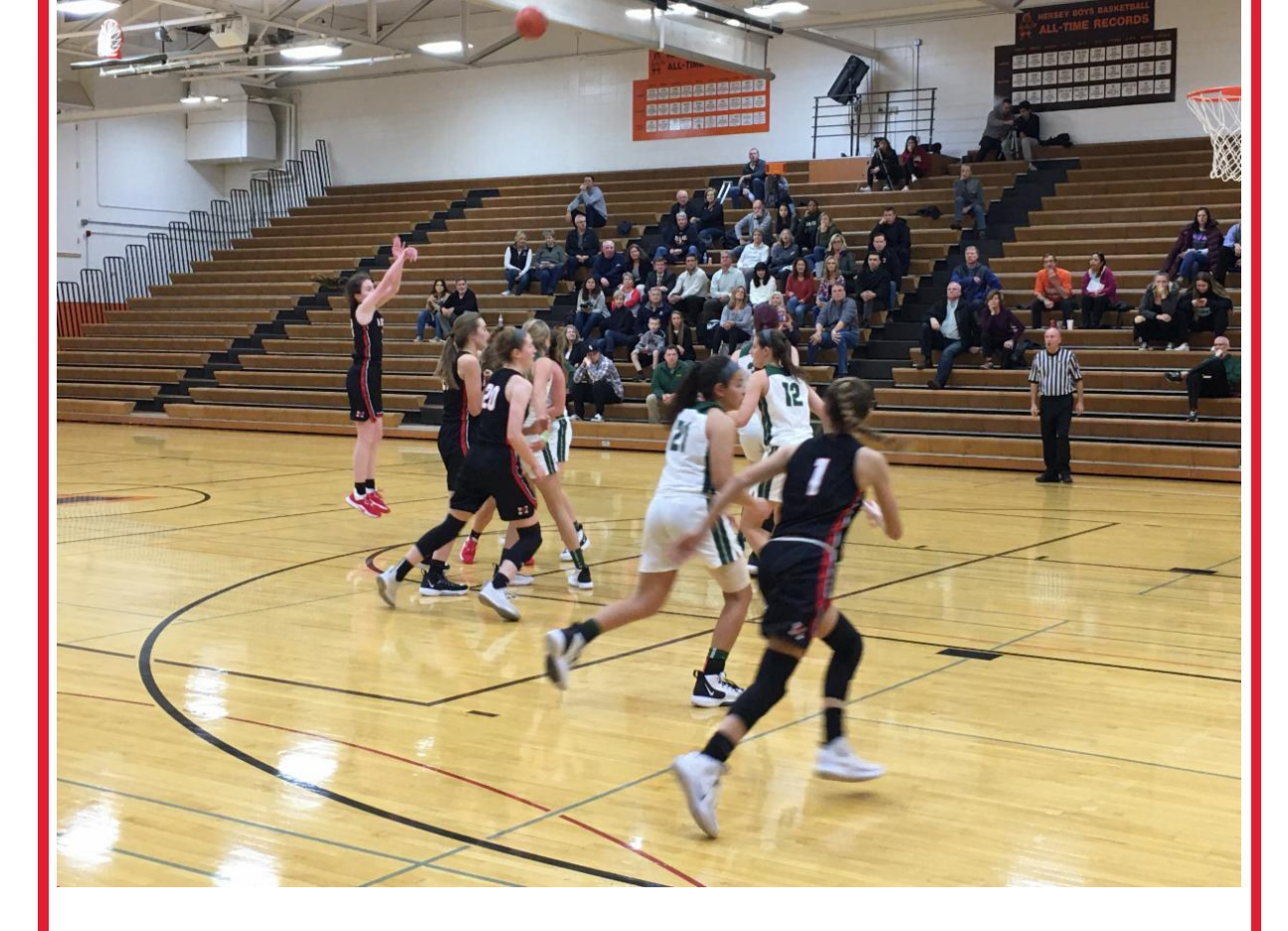
Congratulations to the Girls Basketball team on their 3-0 start to the season