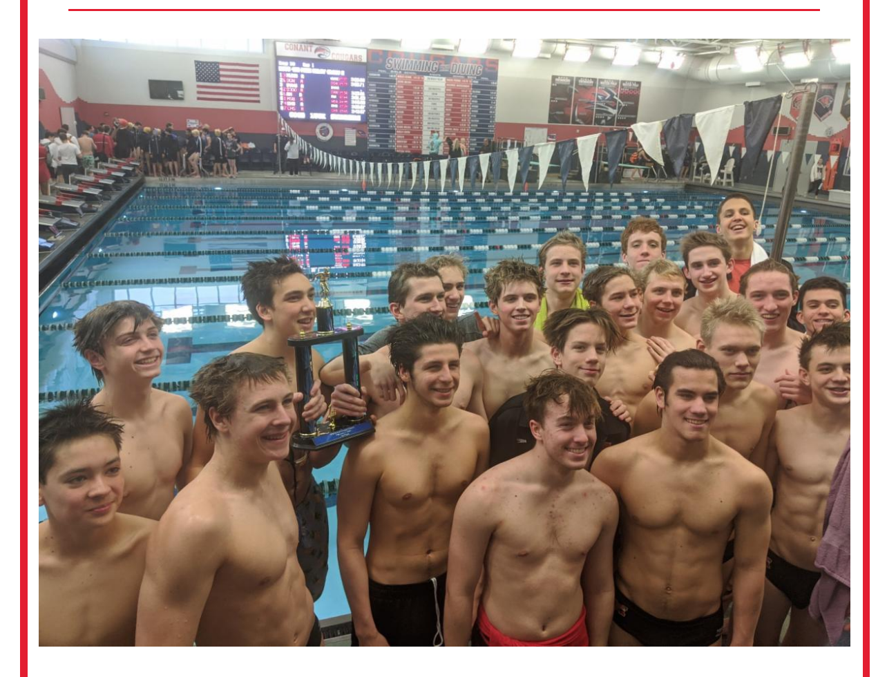
Congratulations to the Boys Swim/Dive team on winning the Conant Invite