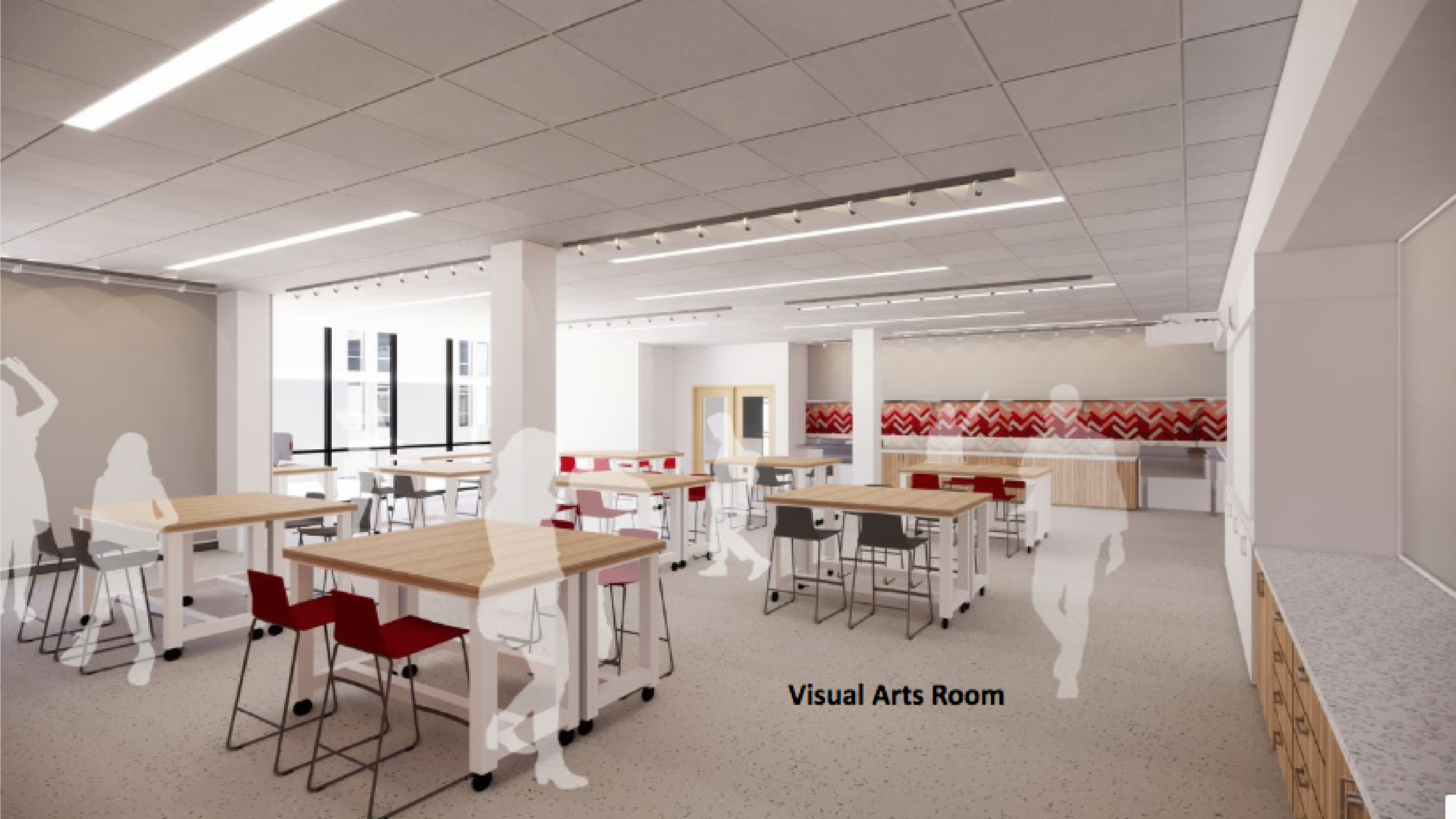
Visual Arts Room