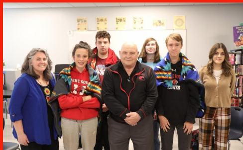
Respect for Nature Award Winners

"If something is important enough, even if the odds are against you, you should still do it."