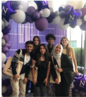
D207 students at Medill Journalism Career Trek Fall 2022

This year we are taking a small group of students to Northwestern University Medill's High School Journalism Day. On this Career Trek, students will get to visit the School of Journalism and attend workshops that will help them enhance their journalism skills. This Trek is best suited for students in the Journalism or Newspaper class. Students can talk to their Career Coordinator for more details.