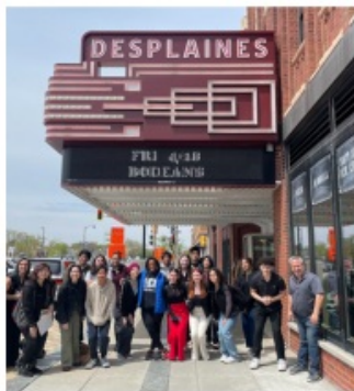
D207 students at our Career Trek at the Des Plaines Theater Spring 2023